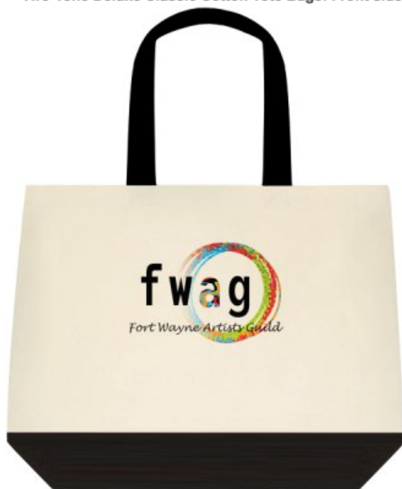
Two-Tone Deluxe Classic Cotton Tote Bags: Front side

Let people know you're an artist and start conversation while you shop at your local markets!